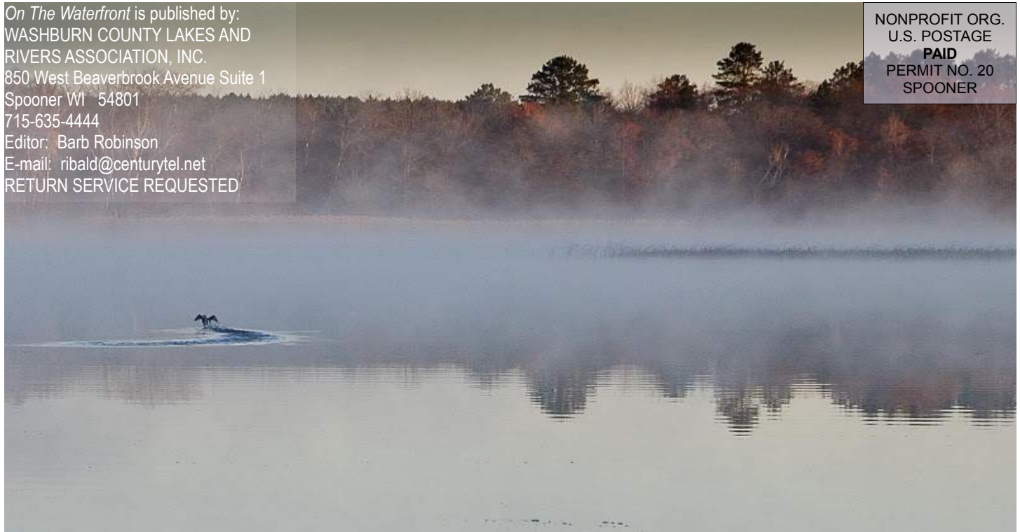
Gilmore Lake, October 2010

NONPROFIT ORG. U.S. POSTAGE PAID PERMIT NO. 20 SPOONER