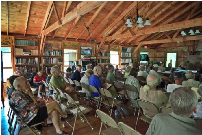
Hunt Hill Library

After breakfast the group moved over to the Library for the Business Meeting and Speaker presentation.