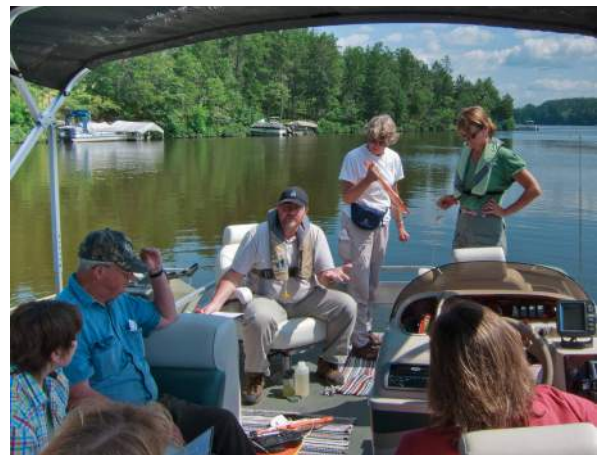
Pontoon Classroom on Minong Flowage

In 2010 our focus continued to be on education with a very successful Pontoon Boat Educational Field class held on the Minong Flowage. This year we have been successful in obtaining funding from the Town of Minong and a grant through the Wisconsin Department of Natural Resources (WDNR) for significant safety and aesthetic improvement of some of the town's boat landings. Docks will be installed on Bass, Pokegama and Gilmore lakes which will improve lake access for area residents and visitors. Also in 2010, we have begun evaluating and coordinating AIS activities in some of our larger lakes.